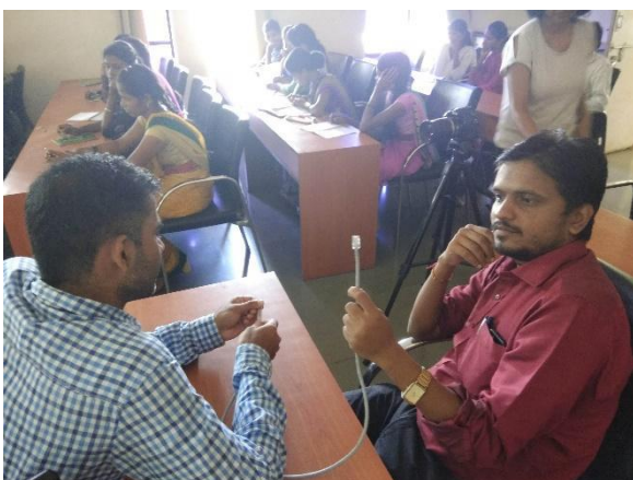
Figure 9: Teaching how to crimp wire by BAIF staff.

This was the second day of barefoot wireless engineers training wherein we focused on how the community can be a part of setting up the connectivity. This was a hands on day where the training was focused on various hands on things like how to crimp the wire, community radios and how to use local applications that run without connectivity. We divided into different groups and each of the groups was taught how to crimp wires. This is an essential thing in the connectivity domain. Please refer to Figures 9, 10, 11 and 12. There was a very good group participation and participants were happy to learn and crimp the wire.