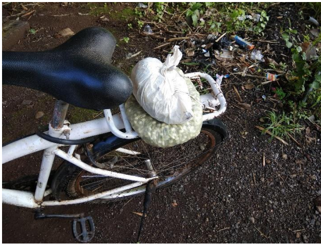
Figure 19: Mogra farmers aggregating the flowers and then taking it to Mumbai flower market.