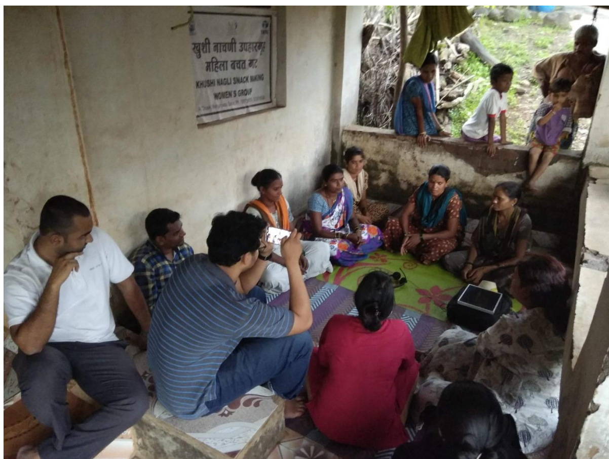
Figure 1: Discussions with women of SHG making finger millet Laadoos in Wanganpada.