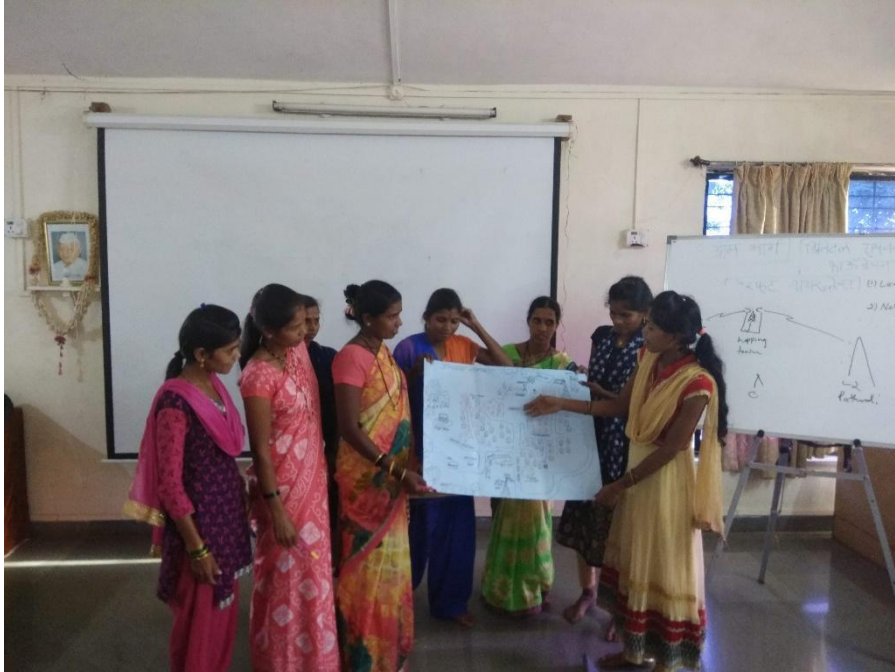
Figure 6: Team 1 presenting on expectations of wireless connectivity in Dongarpada.

The training explained the fundamentals of wireless communication, location selection of communication devices and explained the technical details of IP (internet protocol) addresses. The training was primarily translated by Mr Gorakshnath Bhor. In the evening three teams presented their aspirations of wireless connectivity in three hamlets of Pathardi, Ramkhind and Dongarpada (Figures 6, 7 and 8)