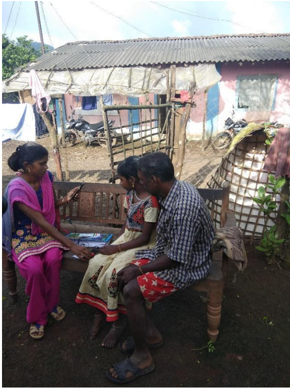
Figure 13: Anjali tai enabling banking facility in the village.

This was also the Foundation day of BAIF. After we returned from the field, we participated in a small ceremony organised at BAIF campus in Jawhar. We paid respect to the founder of BAIF and people at the BAIF office shared their experience in working with BAIF. Please refer Figure 14.