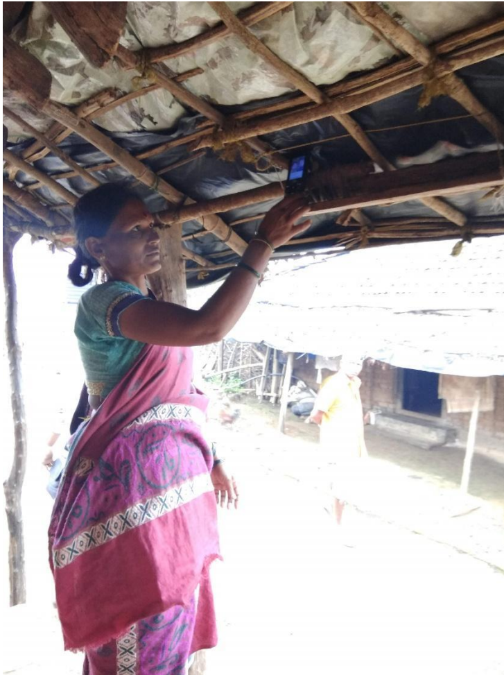
Figure 2: Ingenious ways to get connected in Mahalepada in Khuded Gram Panchayat.

Harpale of Mahalepada about the network connectivity situation especially Jio. In two of the houses Jio connection was available and people had found ingenious ways to get connected to the network (Figure 2). We also discussed about the possibility of creating an eDost from Khuded, as there was little connectivity but no banks/ATMs nearby.