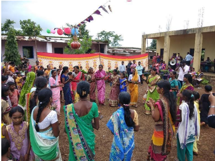
Figures 16, 17 and 18: Women participating in the wild food festival.