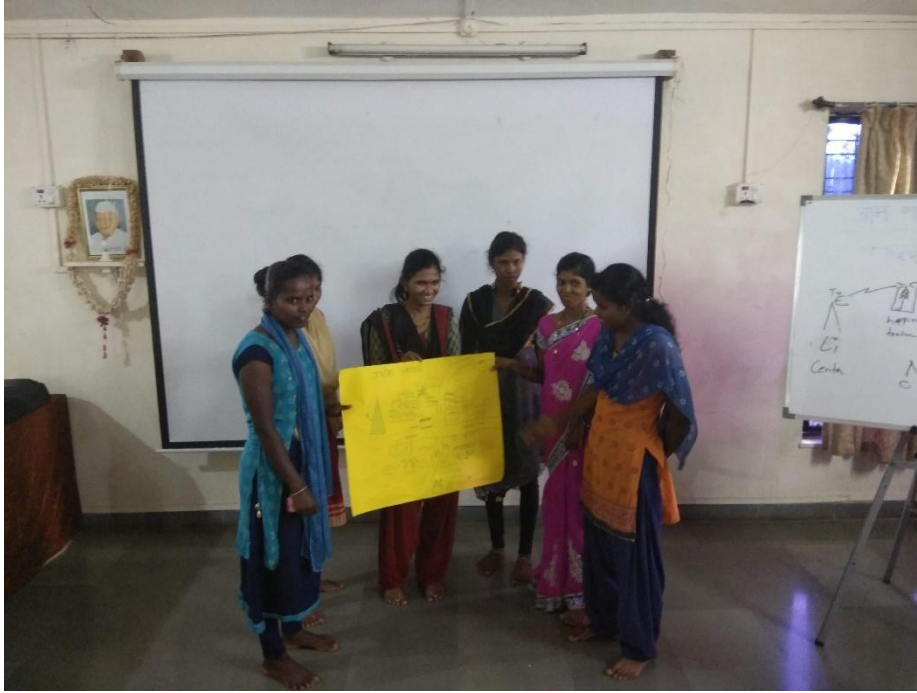
Figure 8: Team 3 presenting on expectations of wireless connectivity in Ramkhind.