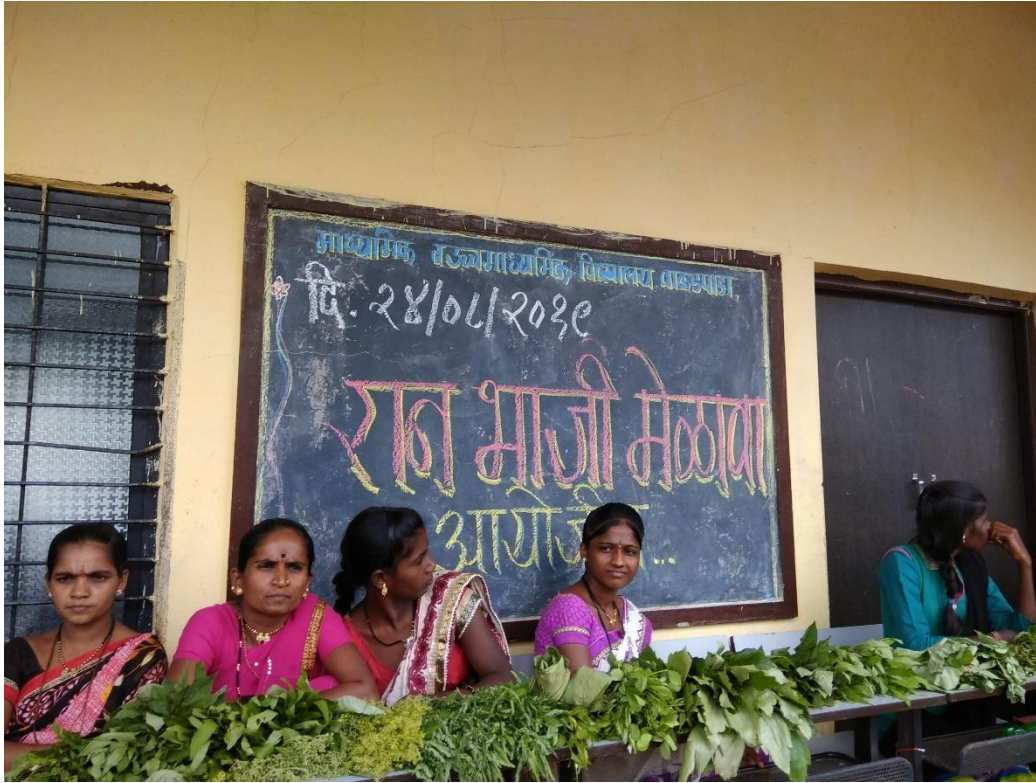
Figure 15: Women SHGs exhibiting green leafy vegetables at the wild food festival.

After participating in the Foundation day celebrations, we proceeded for Mokhada where the wild food festival was organised by Mr Sanjay Patil. It was nicely organised with a few talks by eminent people, women SHGs exhibiting green vegetables which are specially found during the monsoon. We also had food cooked by the villagers at this location (Please refer Figures 15, 16, 17 and 18).